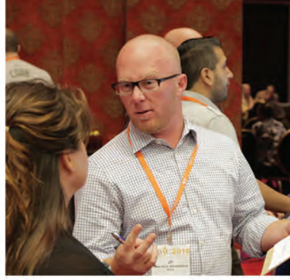
Exhibit at the 23rd Annual Wild West Veterinary Conference The Right Place to Establish New Industry Relationships

October 11 - 15, 2017 - Peppermill Resort Spa Casino - Reno, Nevada